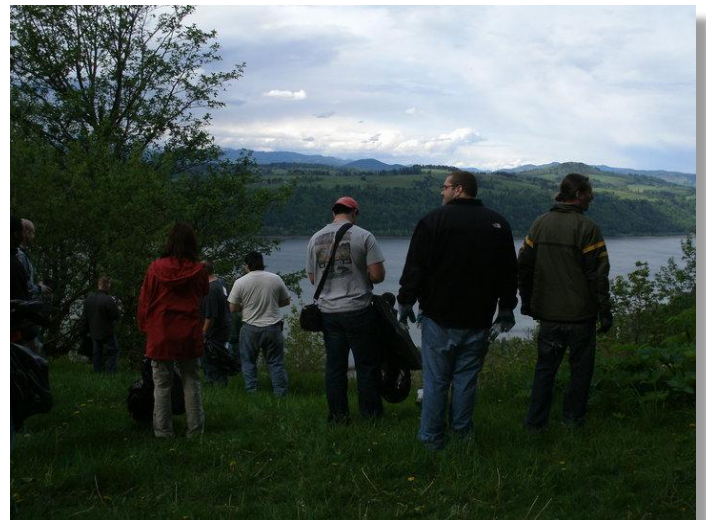
Enjoying the view of the Columbia Gorge