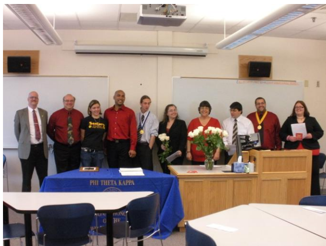
New Members and Officers