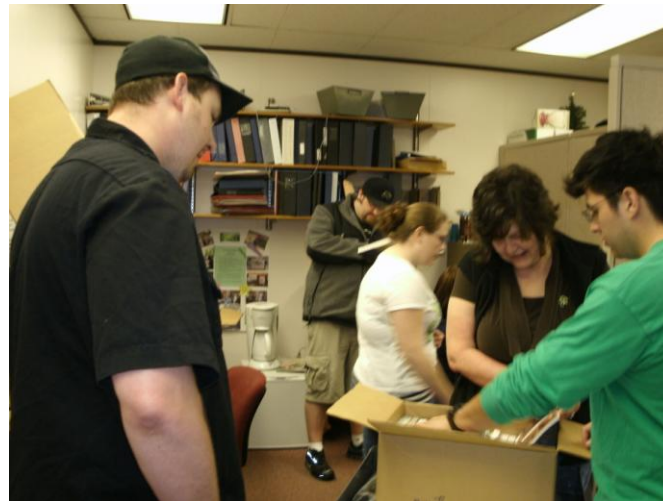
Better World Book Drive Scanning on St. Patrick's Day