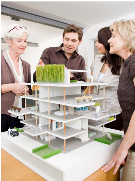
Green building designers meet with clients

A large portion of the green jobs profiled in the Guidebook are found in the traditional employment sectors of manufacturing, installation, fabrication and operations. Other opportunities exist in both urban and rural settings within industry sectors like green buildings, renewable energies, energy efficient auditing, power plant operations, facilities management, and farming. These jobs pay workers affordable living wages, grant them access to healthy and safe working conditions, and provide opportunities for advancement. Tools like basic job training, job placement assistance, high school youth services and hands-on apprenticeship programs offered through unions, colleges and private companies can help people with little or no experience reach professional goals within a few years.