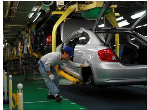
Assembly line worker at a Toyota Prius plant

New environmental initiatives on renewable energy, energy efficiency, and greenhouse gases will spur tremendous job growth in the coming decades. According to analysis from the California Air Resources Board, at least 100,000 new jobs will be created in California alone because of the state's 2006 global warming solutions law (AB32). 1 Despite these encouraging projections, many Californians are unfamiliar with the opportunities offered by the burgeoning clean-tech economy. This book is a navigational tool for anyone interested in joining or learning more about the clean economy of the future.