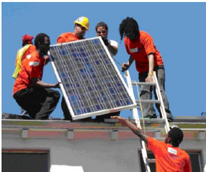
Richmond BUILD program graduates install solar panels on the home of a low-income Richmond resident. Along with its solar partners, Solar Living Institute, Solar Richmond and GridAlternatives, RichmondBUILD prepares trainees to be tomorrow's green-collar workers in the solar industry. Richmond BUILD also prepares their students for the construction industry as well.