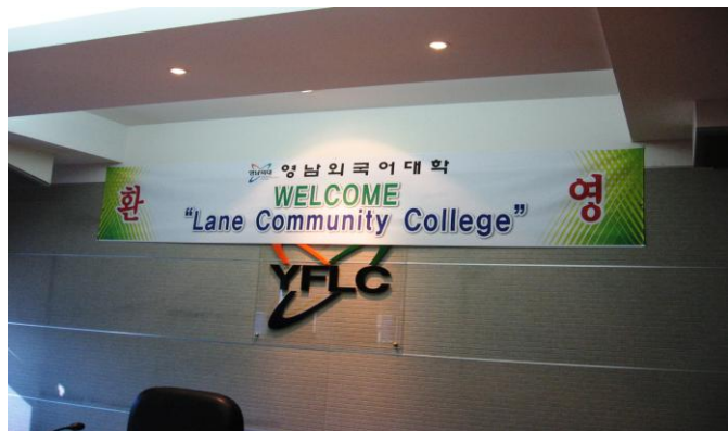
Youngnam Foreign Languages College in Korea