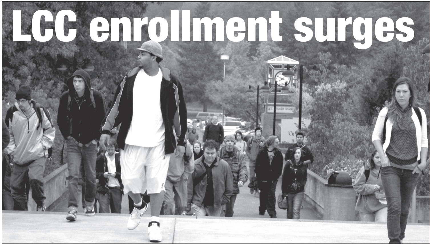
Buses arrive from the University of Oregon and Eugene Station, bringing students to Main Campus in time for morning classes. Temporary parking lots were added during the first two weeks of classes to accommodate the enrollment increase.