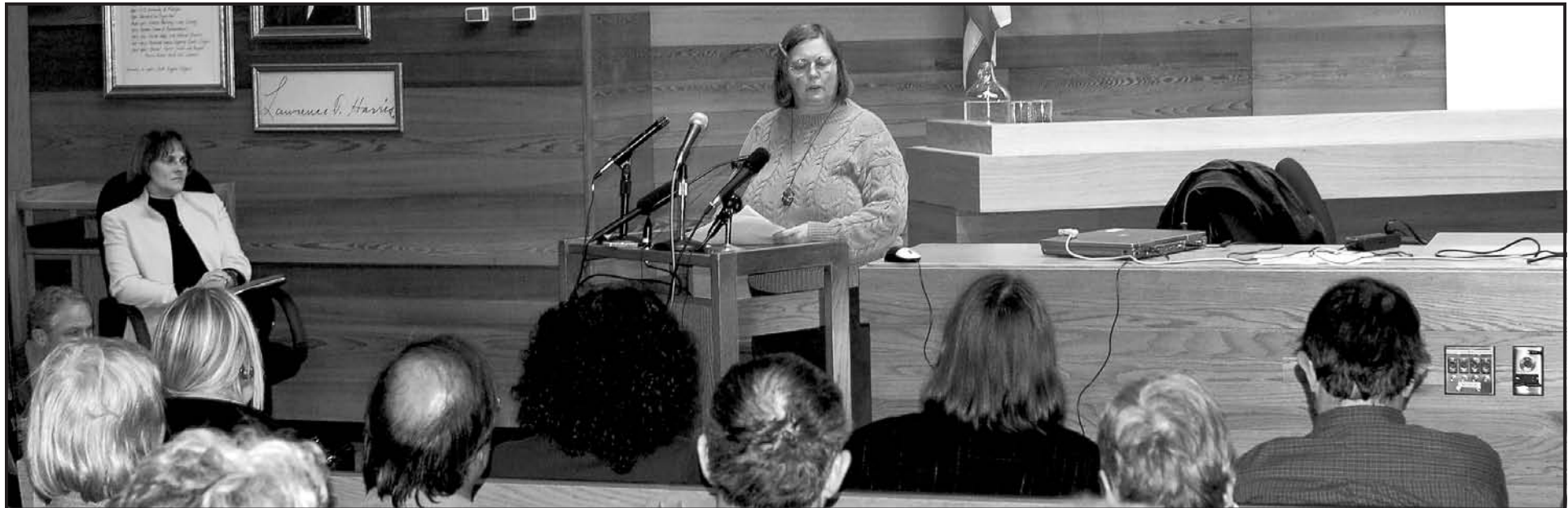
Lane County Energy Round-Up features speakers and presentations by local leaders of the alternative energy movement on issues ranging from electric cars to mass transit. The doors of Harris Hall are open to the public at 6 p.m. on Oct. 16.

– Kathy Ging, Lane County Round-Up director