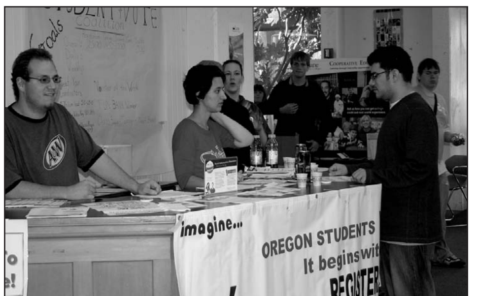
The Student Vote Coalition has registered more than 623 students since the beginning of Fall term. The coalition may be found most days in the cafeteria working towards the goal of registering 1,500 people by Oct. 14.

These numbers are "not as high as we hoped, but that means everyone is registered and that is the main goal," Morton said.