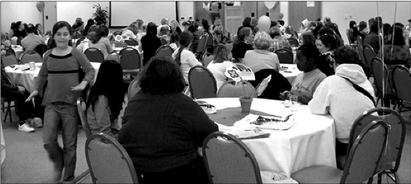
Girls Rule! honors girls with an all-day event. Activities include workshops about body image, menstruation, communication and relationships. Girls Rule! takes place in LCC’s Center for Meeting and Learning on March 14, at 9 a.m.

College welcomes girls, adults at one-day event