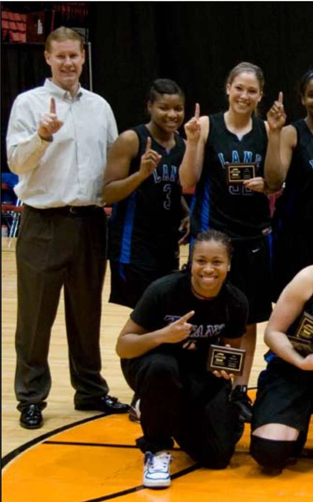
The Titans capped their season by winning the Northwest the third time in four years the team took home the title. It w