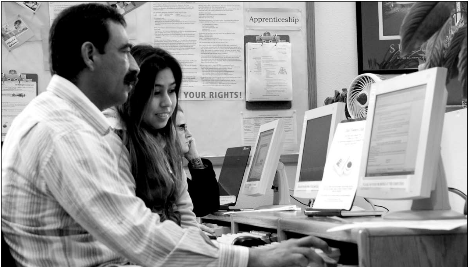
To combat rising unemployment rates, LCC is offering help to the public with Career and Employment Services and The Workforce Network. The programs provide resources and workshops focusing on job finding skills.

Workforce Network posts job listings on the wall in Building 19, Room 266. They also show people how to find jobs on the computer, and help them figure out where to begin their