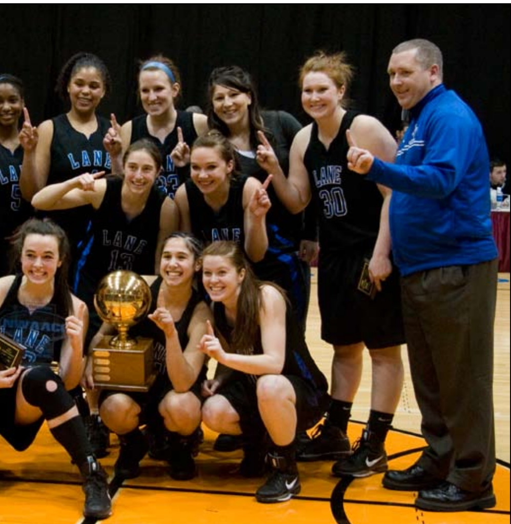
h Athletic Association of Community Colleges Championship Tournament March 5-8. It was as a welcome return to glory after a third place finish last year.