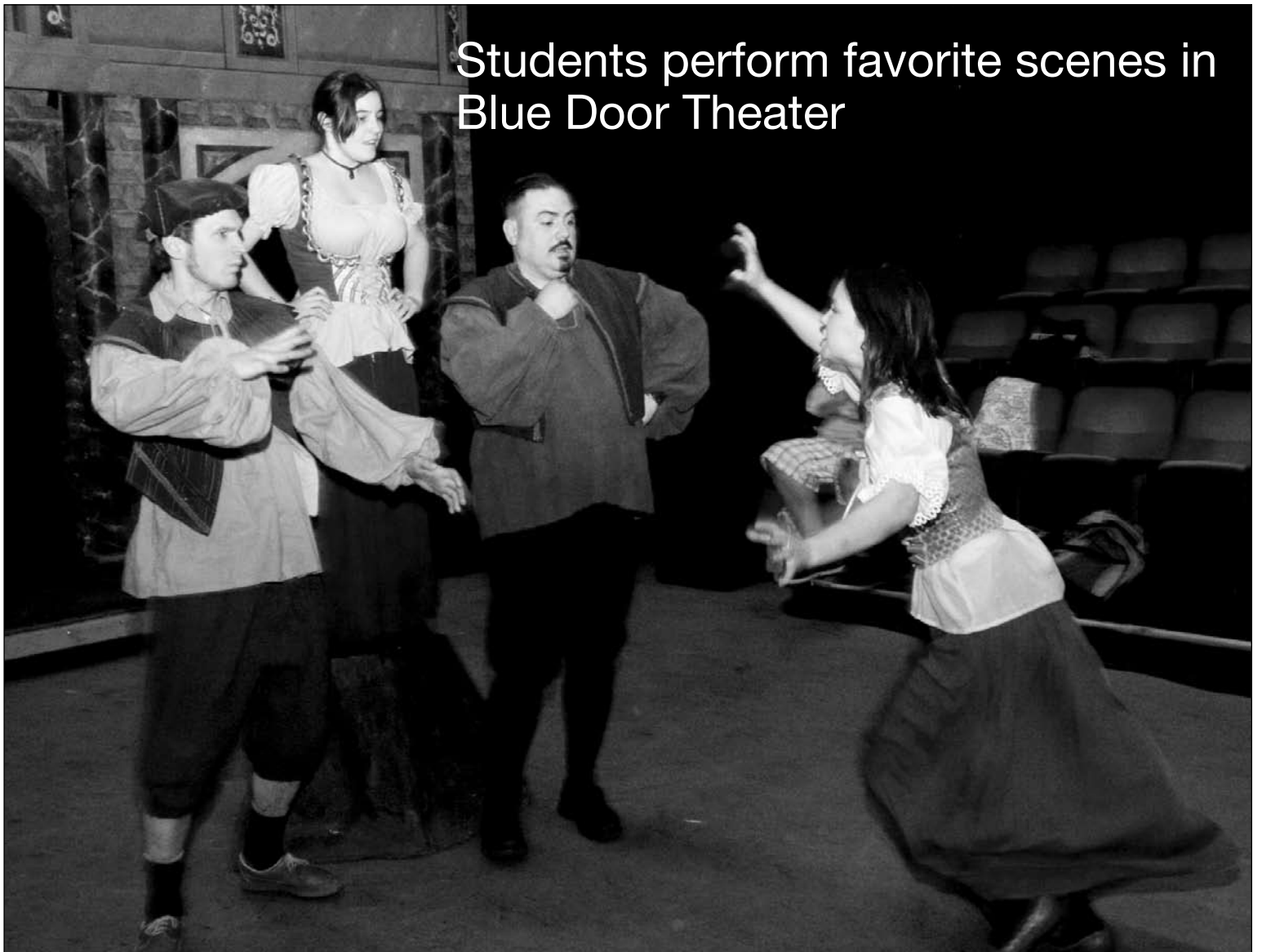
Students perform favorite scenes in Blue Door Theater

The performance aspect of the recital became so prominent that