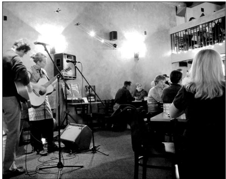
The Loft is essentially an extension of Turtles Bar And Grill where restaurant patrons can enjoy a more relaxed environment. Live music is provided by acoustic acts every Thursday, Friday and Saturday nights.