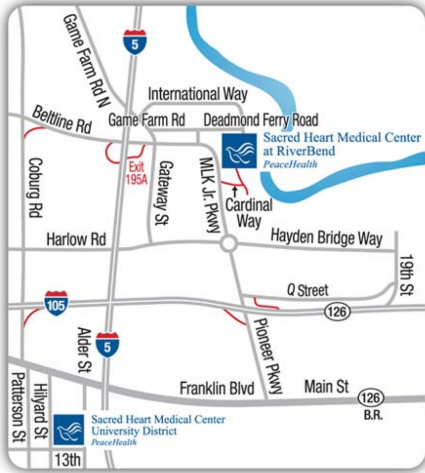
Sacred Heart at RiverBend Sacred Heart University District

For Any Kind of Emergency, Call 911 On Campus Medical Emergency 541-463-6666